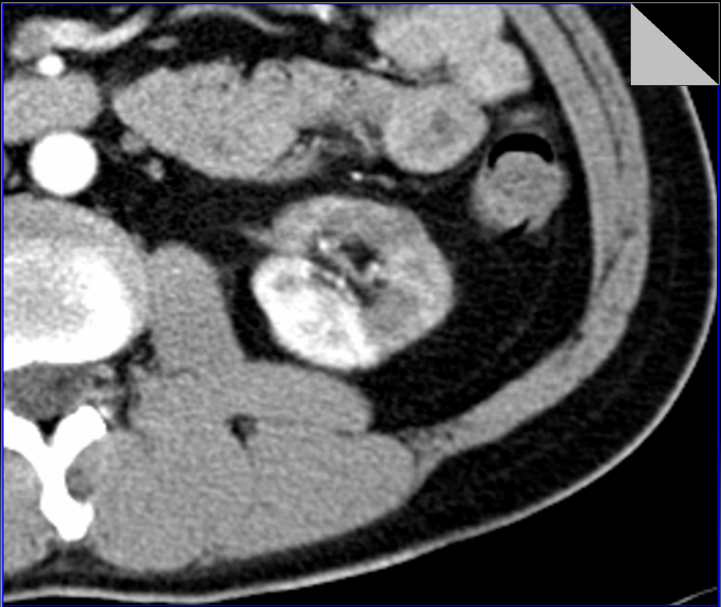
図 4 腹部造影CT(動脈相)発症1週間後